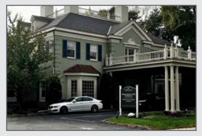
1124 E. Ridgewood Avenue Ridgewood, NJ 1,817 sf for sale or lease