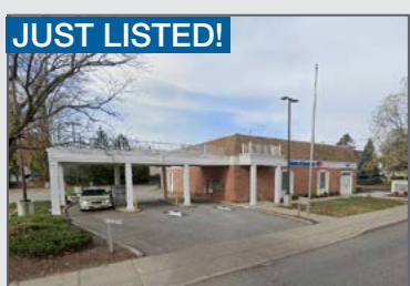
364 Lafayette Avenue Hawthorne, NJ 3,851 sf for sale or lease