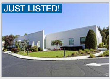
305 W. Grand Avenue Montvale, NJ 28,000 sf for lease