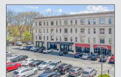
81 E Route 4 Paramus, NJ 10,000 sf for sale or lease